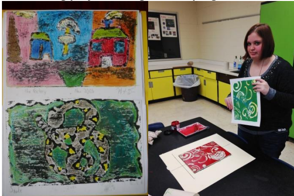
Heritage High beginning and advanced prints