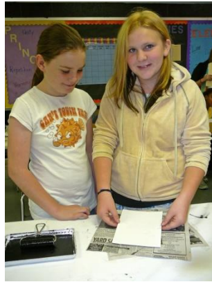
Students printing glue line relief prints in a Hickman County classroom.