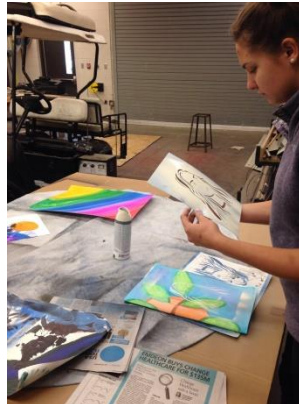
Westmoreland High advanced and beginning prints