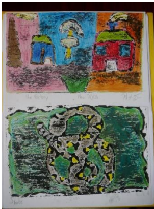
Top: old Hickman Co. Factory Below: Tennessee Snake